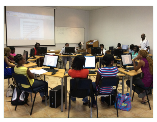
Office administration trainees.

Mathematica Policy Research conducted a random assignment evaluation to determine the impact of the offer of a VTGF scholarship on training applicants' outcomes. Eligible applicants to each VTGF-funded training in which the number of applications exceeded the number of